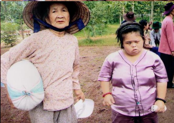
Chronic illnesses people