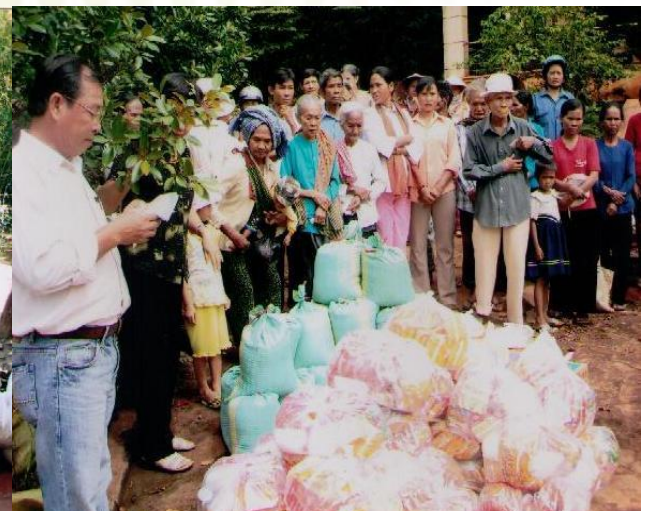
Lonely illnesses elderly