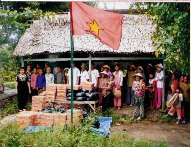
Poorest needed families in the remote areas