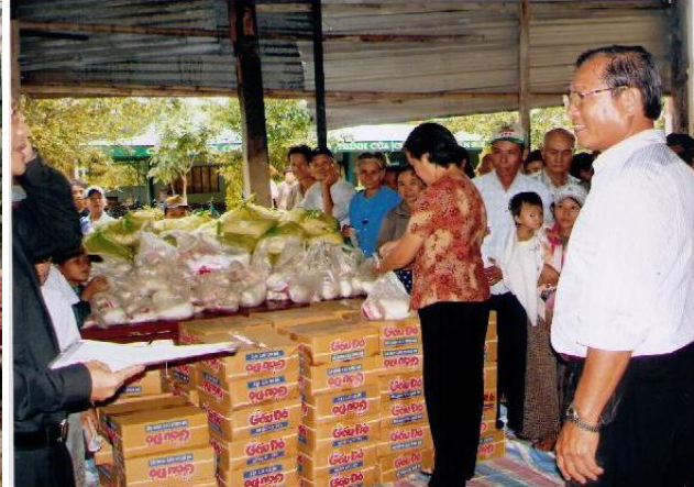
Lonely illnesses elderly