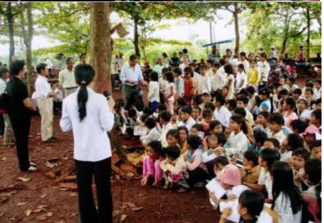
School – age children